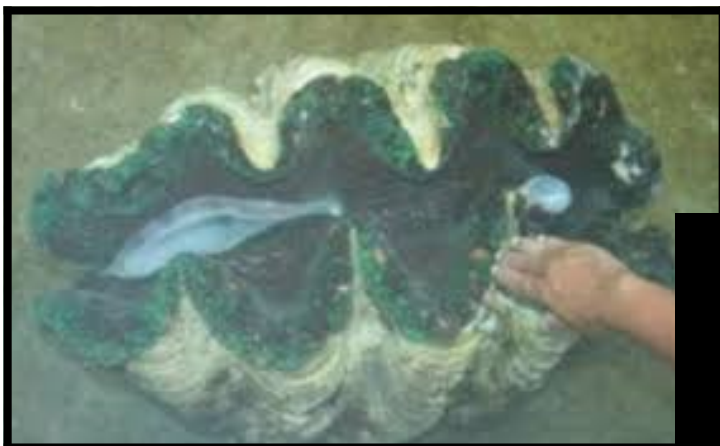
Pearl of Lao-tzu