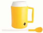
Slushie maker cup

Exciting new Term 4 rewards with a Super Savers theme are now available, while stocks last!